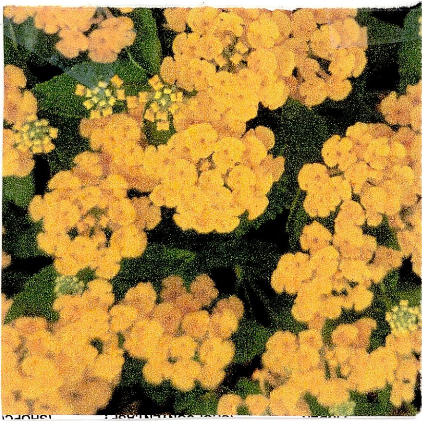
LANTANA NEW GOLD