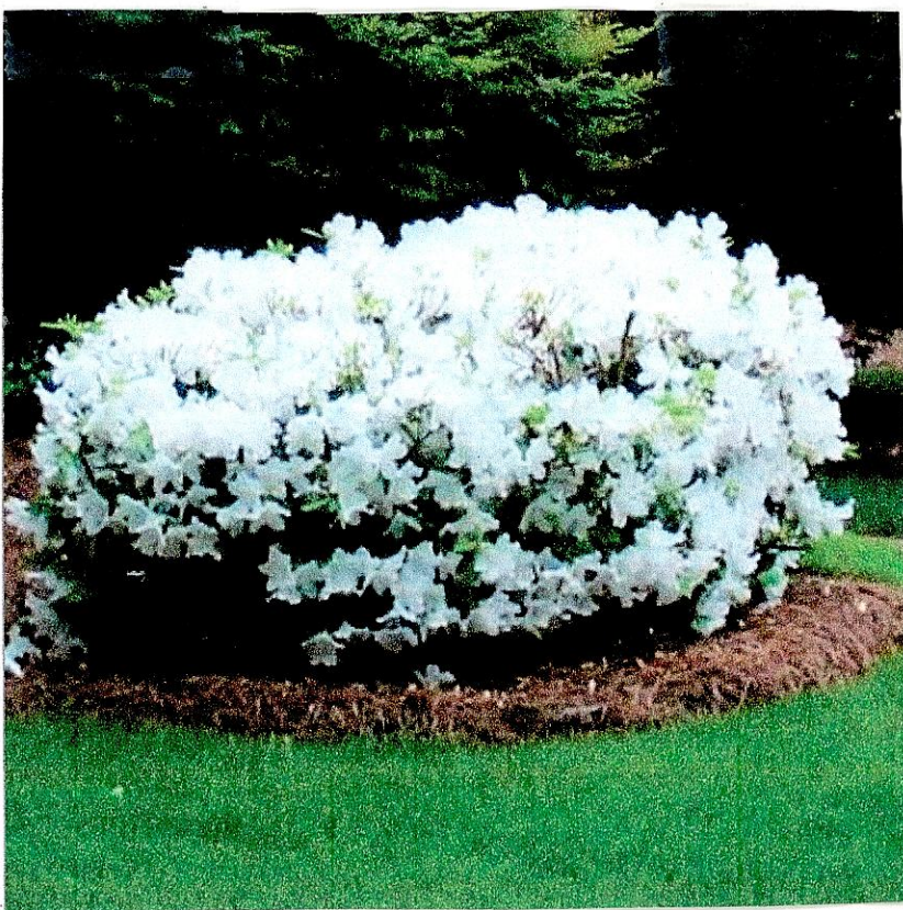
AZALEA FIELDERS WHITE